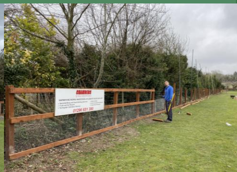
Top rails to be added and post to be levelled off.